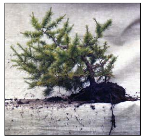
Larch collected 1982

As mentioned above, the best way to obtain a Tamarack is by collecting from the wild. This is best done in the fall when the foliage has turned yellow, but may be done even earlier. In southern Ontario this is usually in October or November, depending on weather conditions.