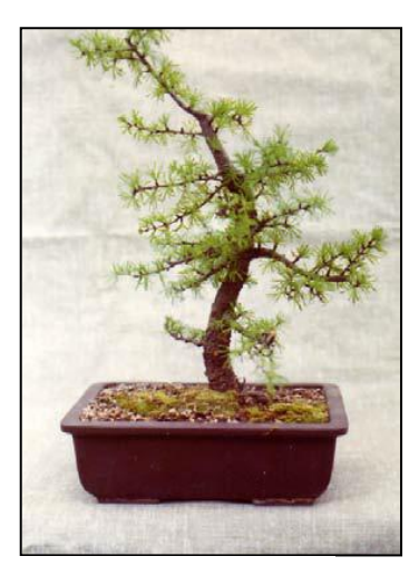
Initial pruning 1984

After this major pruning, keep the tree in a shady location and water only as needed for one week. Gradually bring it out to a full sun location over the next week.